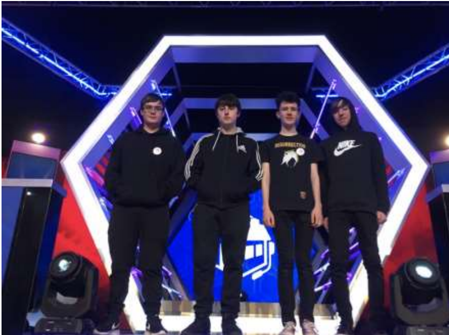
De La Salle team, Resurrection, arrive in London for the digital schoolhouse Esports final 2019.